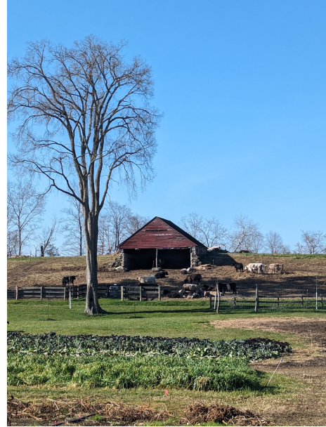
Pictured: Harlem Valley Homestead's picturesque farm property.

This program will run the following Mondays from 3pm-4:30pm: