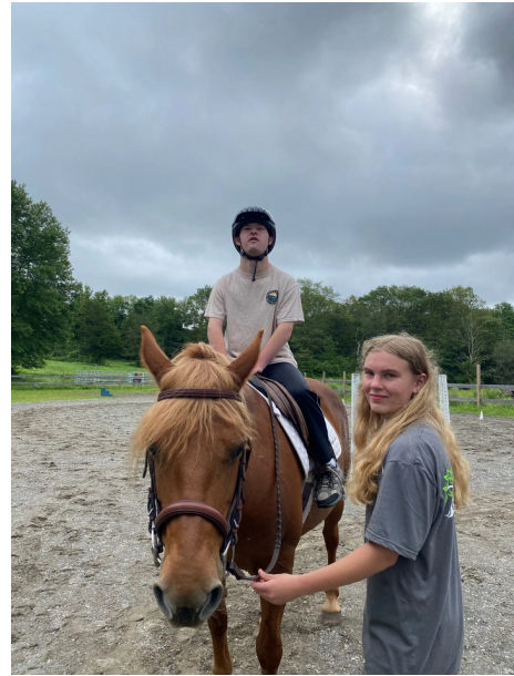
Pictured: Flourishing Farmer takes a ride on one of Hidden Hollow's Horses.

This program will run the following Saturdays from 11:00am-1:00pm: